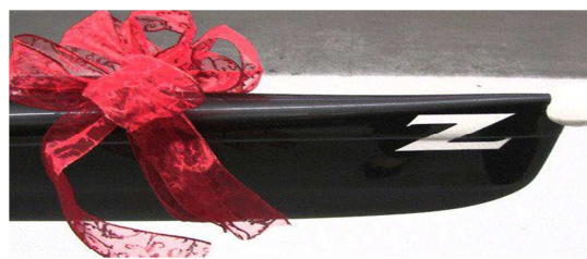
New Edition to EHT Crew purchased by the Crew Boosters 2011 Resolute Intrepid

DID YOU KNOW .....In 2010, The Egg Harbor Township Girls Crew Team competed for rowing's world championship at the prestigious Henley Women's Regatta in England. The Lady Eagles finished second overall, the best finish ever by an American public school